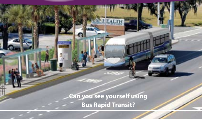
Can you see yourself using Bus Rapid Transit?